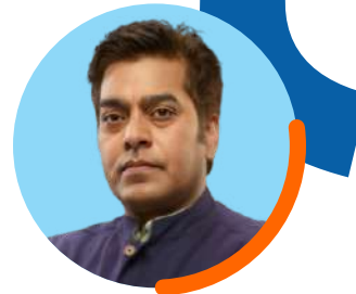
Ashutosh Rana Indian Actor