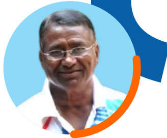
Arjuna Award Ashok Kr. Dhyhan Chand Indian Hockey Player Olympian