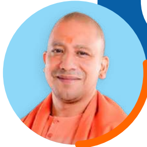
Shri Yogi Adityanath Chief Minister of Uttar Pradesh