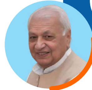
Shri Arif Mohammad Khan Hon. Governor Bihar